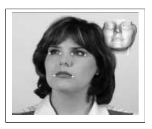
Figure 2: Feature points identified in the face. The head pose is calculated from the eye corners and the nostrils. The 3-d face model is shown in the same pose as the recorded face.

Beside the head pose we focus on the positions of the eyebrows, the shape of the eyes and the direction of gaze. These facial parts move extensively during speech and are a major part of any visual expression of a speaker's face. They are measured with similar filters as described above. They do not need to be measured with the same precision as the features used for measuring head poses. Whether eyebrows move up one pixel more or less does not change the face's appearance markedly.