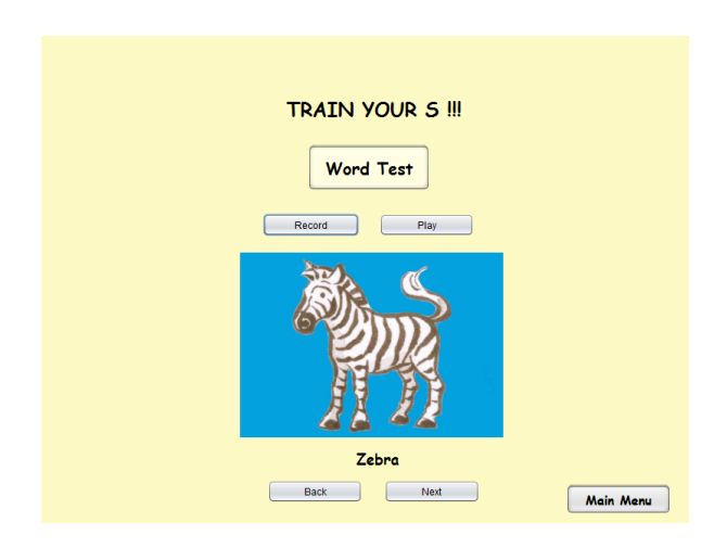
Figure 3: Screenshot of the main page of the Java applet

In this paper we have proposed an automatic sigmatism detection tool for children. Our main goal was to classify the speech sounds as normal or pathological at the phone, word and speaker level, in order to assist patients treatment. We used simulated data, manually segmented into these units, for training and testing. We carried out leave-one-speaker-out experiments using different features and classifiers. At phone level we achieved a Recognition Rate (RR) of almost 86 %. At word level the RR value slightly increased to 87% and at speaker level, we achieved a RR of 94 %. For the classification of sigmatism types, i.e. four class problem, we were able to achieve about 63 % of RR at speaker level. The lowest recognition rates were, as expected, from the dentalised and interdental classes, both below 50 %. The classification results on the pathological dataset were not as good because of the mismatch between training and test data, but still we achieved a 75 % recognition rate without the need of recording disordered speech data for training. We expect then that with a larger dataset, containing more children's speech, we can improve recognition rates on