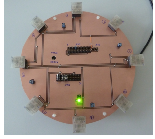
(a) Microphones on daughter boards