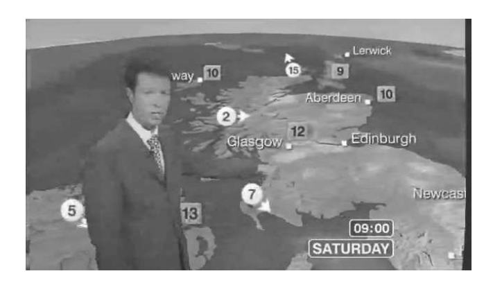
Figure 2: A screenshot of a Weatherview report.