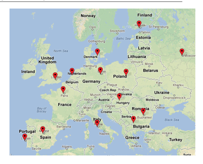
Figure 2: Demo screenshot: this geographical interface to voices can be found at http://tundra.simple4all.org/demo.

Static and interactive demos of the resulting voices are available at http://tundra.simple4all.org/demo. A screen shot of the geographically-organised demo page is shown in Figure 2.